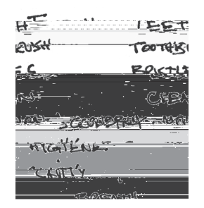
Figure 2 (above) Raw taxonomy