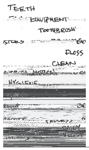
Figure 3 (above) Prioritized taxonomy